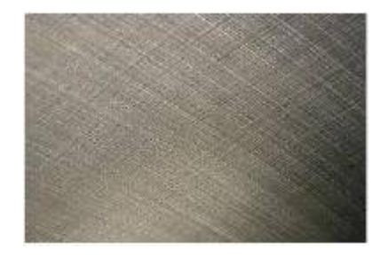
Fig 2 cross batch

A "cross hatch" pattern is used to retain oil or grease to ensure proper lubrication and ring seal of pistons in cylinders. A smooth glazed cylinder wall can cause piston ring and cylinder scuffing. The "cross latch" pattern is used on brake rotors, and flywheels. Abrasive grains are bonded in the Form of sticks by a vitreous or resin material and sticks are presented to the work. For cylindrical surfaces the abrasive grains are given a combination of two motion-rotation and reciprocation. The resultant motion of the grains is a Crosshatch lay pattern with included angle between 20 and 60.