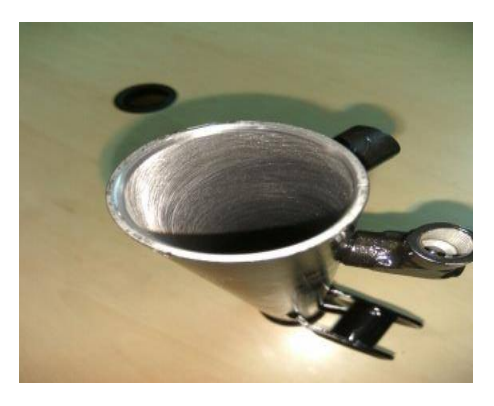
Fig.5: finished component

reciprocating in linear motion and rotates in one direction to machining the hydraulic cylinder. The grain size of the diamond tip will be smaller to increase the accuracy of the dimension in hydraulic cylinder.