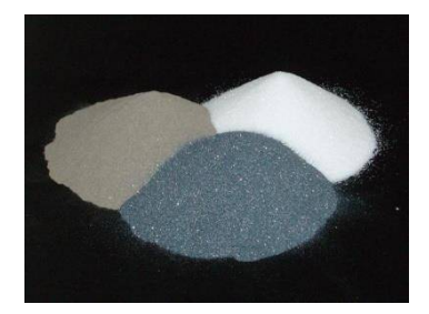
Fig 4: Abrasives III. NORMAL OPERATING TOOL

3. Diamond is used for honing extremely hard and wear resistant materials such as tungsten, carbide or ceramics.