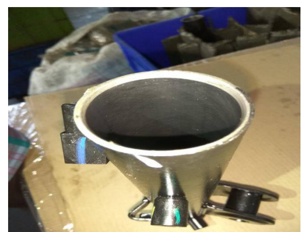
Fig 6: Finished component Implemented operating stick specification: Length = 100mm

The implementation of tool have the same specification but the difference is increasing the grain size of the abrasive particles. It helps in more metal removal rate with low pressure. If the pressure of the tool is decreased the stick mark is reduced.