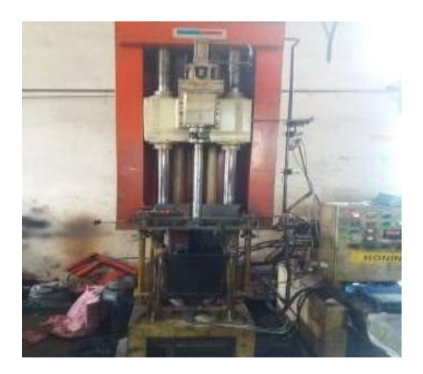
Fig 7: working

Honing is a low velocity abrading process in which stock is removed from metallic or non-metallic surfaces by bonded abrasive sticks. It is a finishing operation employed not only to produce high finish but also to correct out-ofroundness, taper and axial distortion in work piece. In honing, since a simultaneous rotating and reciprocating motion is given to the stick, the surface produced will have a characteristic cross-hatch lay pattern. In this project we have replaced the fine abrasive partical with the bigger partical and by reducing the spindle pressure the stick mark on the tube get reduced